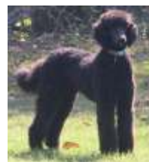
Girard's Delightful Haley - NEwS Normal

JenLane Poodles--Mini and Standard www.jenlanepoodles.com