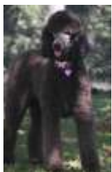
Girard's Fancy Elizabeth—NEwS Normal