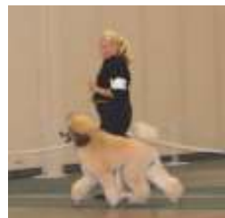
Candace & Neptune

Please remember to share your show news and health testing brags with us.