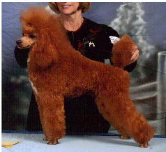
GRCH REINEHAUS N' ECOLA JORJA PEACH