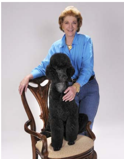
January 7, 1942—March 12, 2011