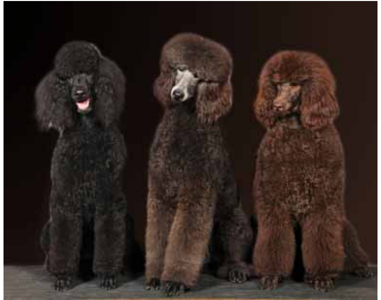
From Left to Right: Quincy (black), Jazz (blue), Mocha (brown)

http://www.facebook.com/#/pages/United-Poodle-Breeds-Association/169482314573 (Open to Everyone—Invite your poodle friends!)