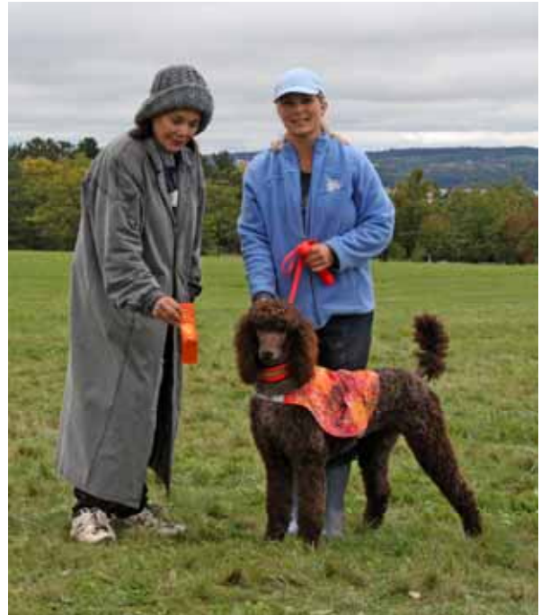
GRCH "K-Lar's Joyous Chocolate Endeavours", CA, CAX, CAT