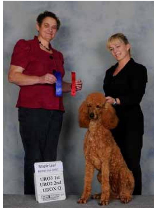
Ch. URO1, URO2, URO3, Bijou's Hot Pepper of Majestic UNITED GREYHOUND CLUB Earned 1 URX leg, Placing 2nd and three 4th Places Judge: Penny Haynes