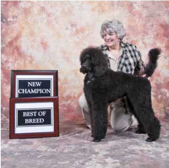
Our newest UKC Champion - Flyindog 2nd Star To The Right aka Electra.