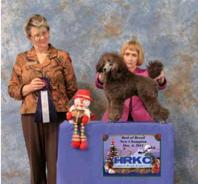
Hampton Roads Kennel Club

My new silver mini pup completed her CH and had 3 BOBs, her first time out.....just turned 7 months. So she is now UKC CH Clas Haus Annie Oakly at Ecola. Her sire is AKC CH Cabryn's Lone Ranger, #10 top mini in AKC in 2007. After she is through showing in UKC, she will begin her AKC competition....if she gets big enough.....she is on the small side, but still growing.