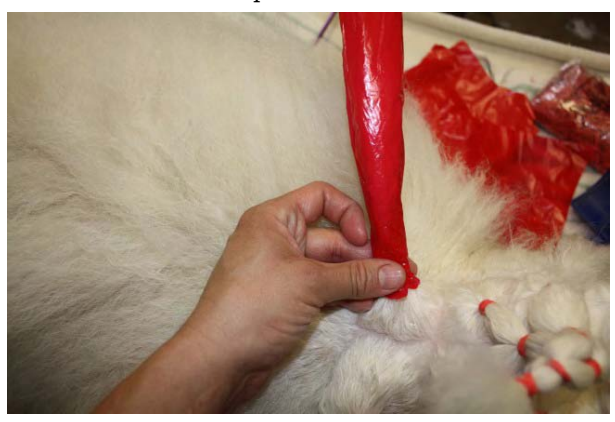
Then fold the wrap in half, lengthwise, and then again fold it in half lengthwise.

Once you wrap the plastic around the coat, secure the bottom of the wrap with a band.