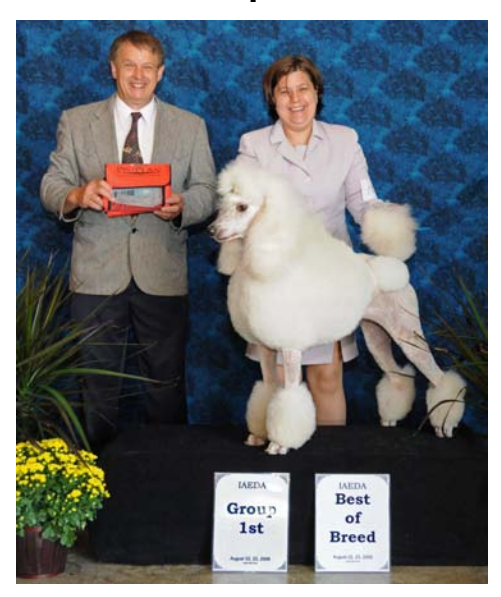
GRCH E'clat's Lady Luck

AKC CH Peckerwood's Man from LaMarka x GRCH UCDX Jazz It Up II CGC CDX