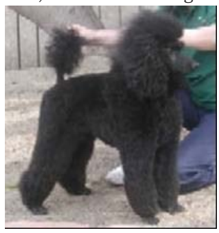
Tiara D'Aire demonstrates how the show dogs do it.

Short synopsis to entice you: Just wash your dog and clean the house and patrol the yard. Don't walk the dog out of your environment during the height of the flea season without washing him immediately when returning. Wash the dog regularly and condition well even within the same week. Top showdogs on occasion, are washed many times within a week without damage to the (Poodle) coats. Good shampoos are used two, sometimes three times, on some showdogs each week.