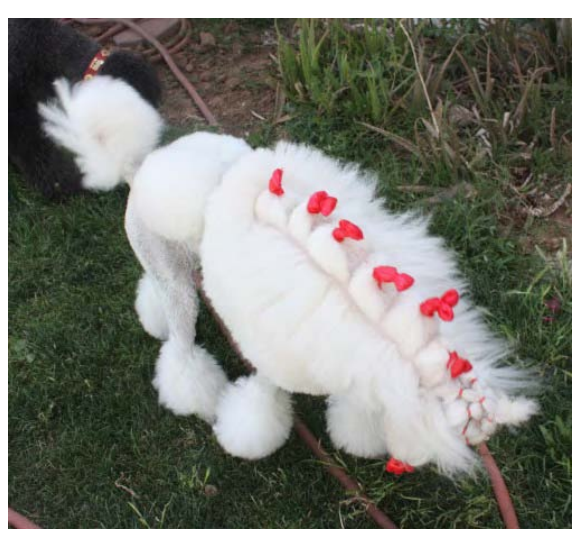
The finished product!