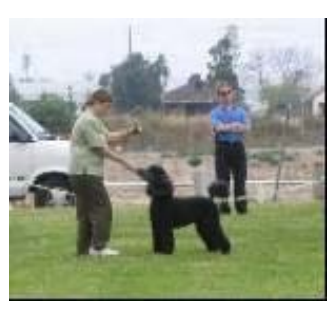
Lovey bathed, pretty and flea-free!

Additional Show details will be provided as they become available.