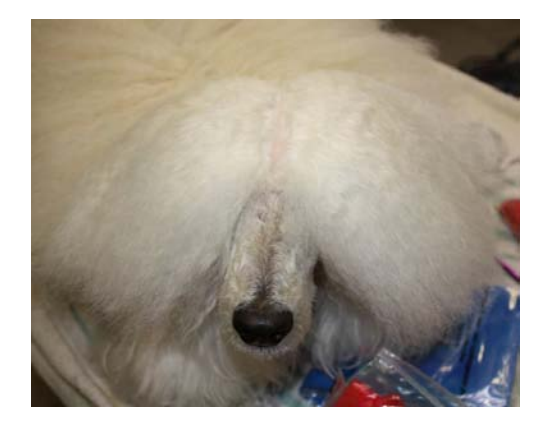
completely dry coat. In Arizona the weather is

You will need to start with a clean, combed out, and