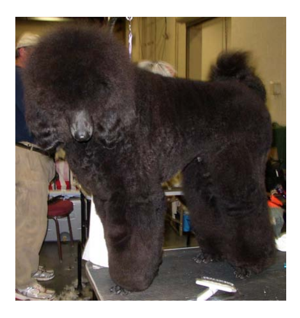
Flyin Dog Dragon Attack aka Junior is now a UKC Champion. He earned his Championship at The Carolina Classic. He went Group 1 in his first show, and went group 4 in his last show.

Our first Flyin' Dog Farm, Bred By puppies are certainly taking after their Momma and Daddy, GRCH Tintlet Petit Fille aka GiGi / JC Pioneers Sumthin To TK Bout aka Rumor. They have produced, out of their first litter, 2 UKC Champions and 1 almost, They were all a few days shy of 10 months old, and at their first show. What a show it was.