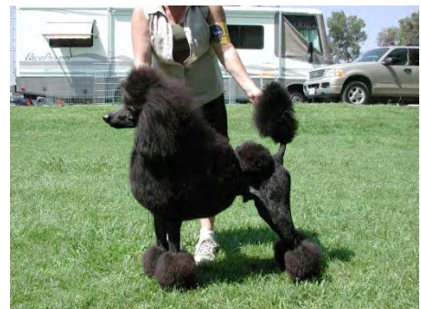
as U-Ch Tiara Obla-di, Obla-da guy who gaited impressively in a full continental