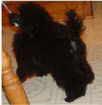
This is Am U-CH Pickets Delight To Dream (CHIC)