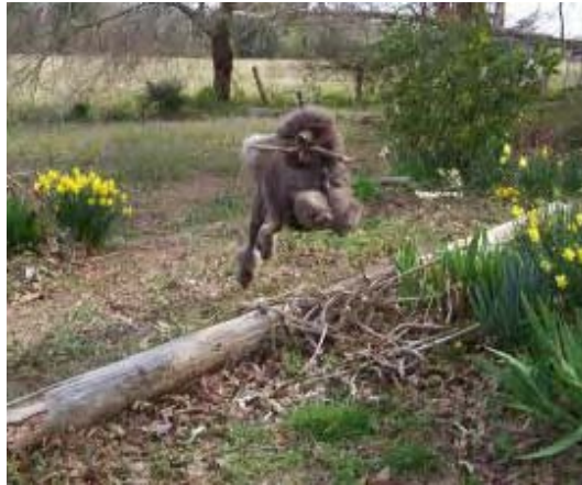
U.Ch. Baldur Song Of Okarina