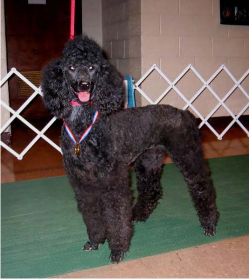
Pic: UKC CH WP's Blueberry Hill Of DGL, CGC (earning her AKC CGC certificate)

UKC CH WP's Cherdons Chequered Love, OFA Legg-Calve-Perthes rated normal and awarded CHIC #29780.