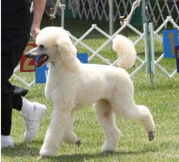
Winner of CH class and B/B CH JCPioneer Tintlet Ruffian( Ruffy)

Gr CH Sisco's I like it Like that won the Gr CH class on Sunday, but lost breed to his littermate Elvis ( Ch Sisco's All Shook Up)