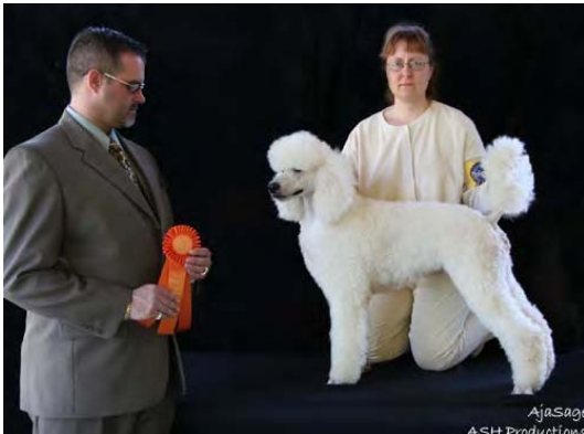
GRCH Jateko Riders On The Storm

UKC CH Jateko Riders On The Storm, WP's Take A Chance On Me, and Dyneau Phantom Call Me Fancy, all CERF tested Normal. UKC CH Jateko Riders On The Storm, and UKC CH WP's Take A Chance On Me are both vWD Clear by DNA.