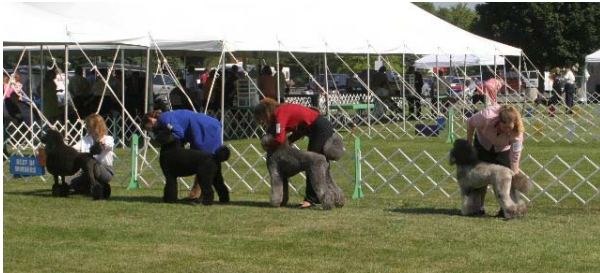
From Solid Top 10