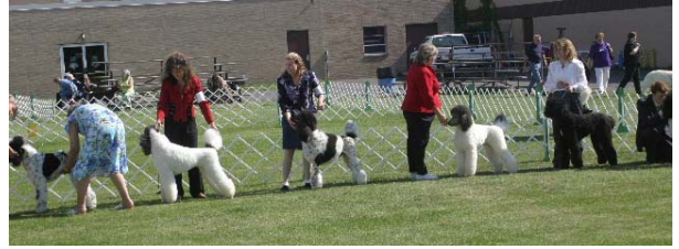
From MC Top 10