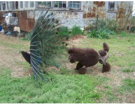
Atumn meets the Peacock!!!!!!!!!!!!