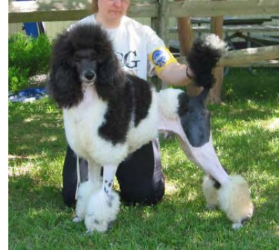
CH WP's Take A Chance On Me. Call name: Leo the Lionhearted

And My Storm, earned her Grand Championship title at the Hampton Roads Weight Pull Club shows at Virginia Beach, Virginia on May 20, 2006 and is now: GRCH Jateko Riders On The Storm.