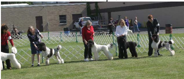
From MC Top 10