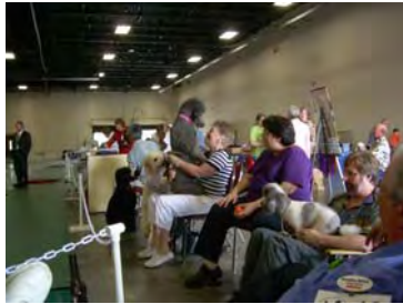
From our Fall Show