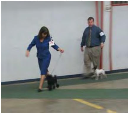
Benroyal Spirit Of Cherity