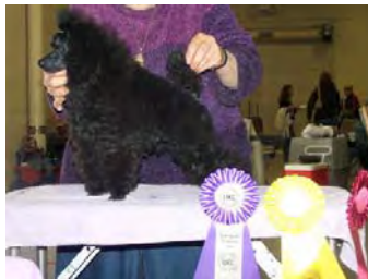
Zorcon Blackberry Casino Royale

Blackberry Casino Royale from his first litter was Best Male, Best of Winners and Best of Breed and Group 4 in both shows for a total of 70 points.....not to bad for the first time in the ring at 6.5 months old!!!!!!!!!!!!!!