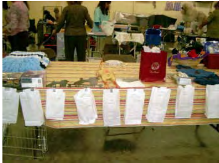
Raffle table (there were some great items there!)

I snapped a few pictures before my camera died....here is one of the grooming area and one of the raffle table.