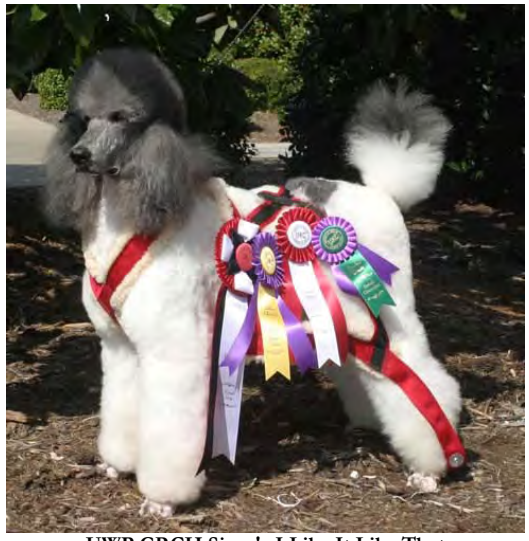
UWP GRCH Sisco's I Like It Like That