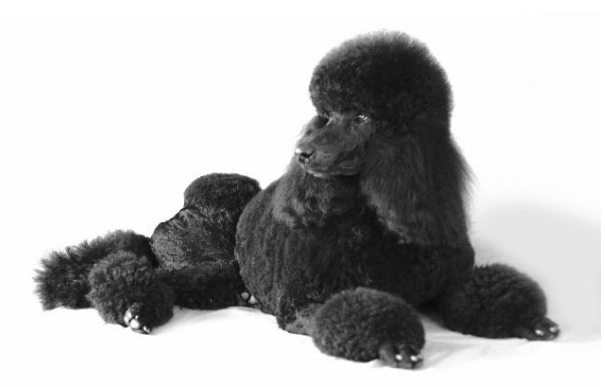
GrCH Tintlet Petite Fille (GirlyGirl,GiGi)

a few weekends. In 2008 and over just 4 weekends Gigi won enough points to finish in the UKC Top Ten, winning BIS at the MCPCA Poodle Specialty during Premier, multiple group ones and a BIMBS before her second birthday. Who knew!?