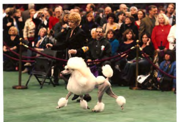
AM, UKC CH CYPRESS SCHEHERAZADE FRONTPAGE