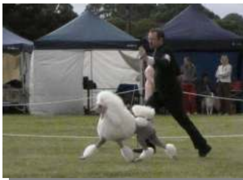
Tia (Sisco's Its Now Or Never) and Kingstons (Siscos An American Trilogy) daughter at her first show over the week end. 13 weeks of age.