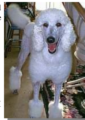
Checker's sister, Mercedes

If anyone would like to Spotlight a Poodle who has played an important role in Parti Poodle History Send your poodle story to refarm@att.net or Mozaicpoodles@hotmail.com