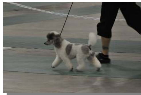
(Sandpipers Bonnie Blue) Bonnie Took Best of Breed in all 5 shows.