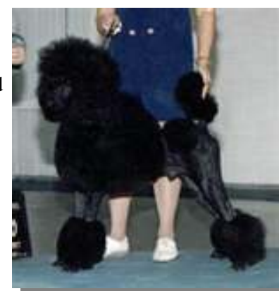
Shelzar's Wild Card aka Maverick