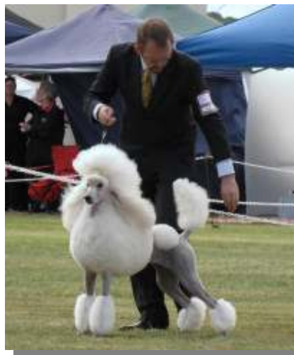
(Presley was her father to make it parti related) She looked lovely and moved like a dream.