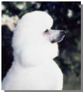
AM CH Litilann's Roland Of Shelzar Checkers Grand Sire.